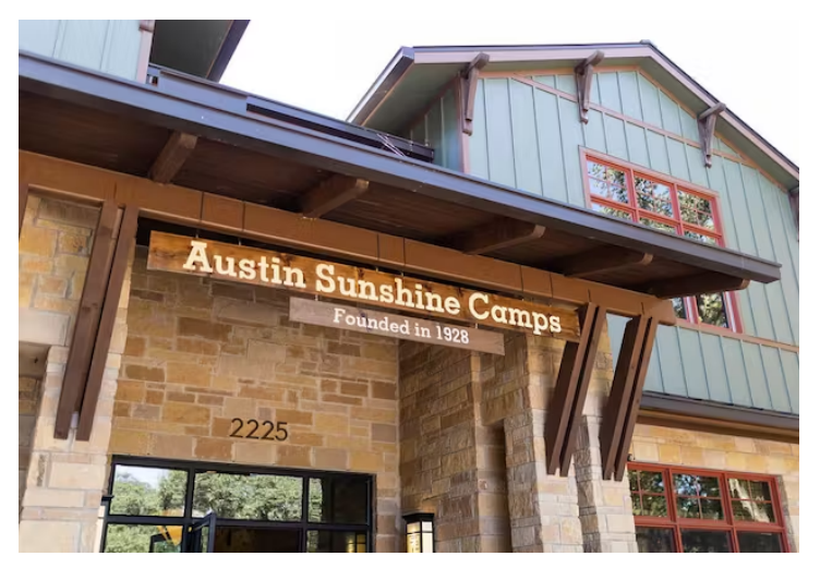
Zilker Lodge Campers Ages 8-11

Austin Sunshine Camps has two locations, each serving different age groups. Campers ages 8-11 attend Zilker Lodge in downtown Austin, while campers ages 12-15 attend our Lake Travis location, in between Lago Vista and Marble Falls.