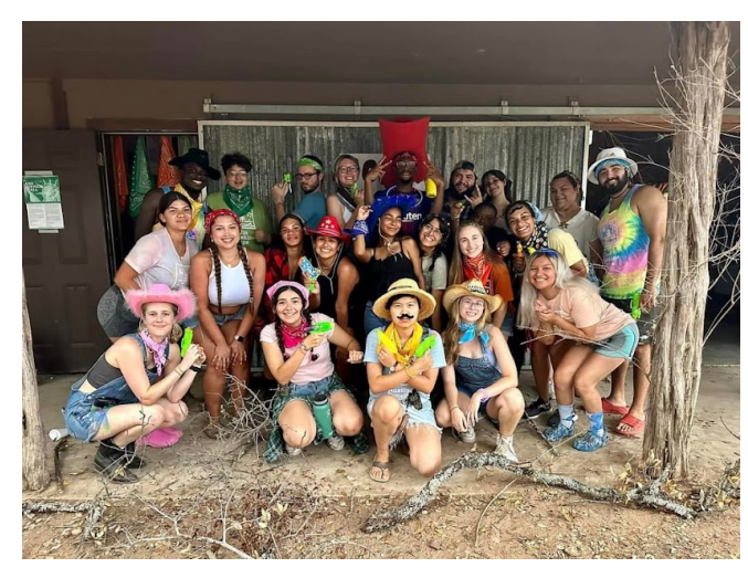
<u>Lake Travis</u> Campers ages 12-15

Watch our Zilker Camp video here: <a href="https://www.youtube.com/watch?v=je5qz3Tyu9Y">https://www.youtube.com/watch?v=je5qz3Tyu9Y</a>